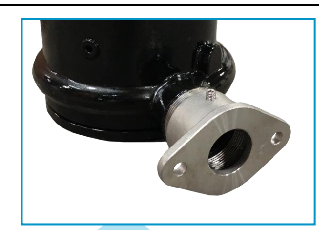
ABS Piranha Adapter (Also Compatible with 1 1/4" Liberty Pump flange)