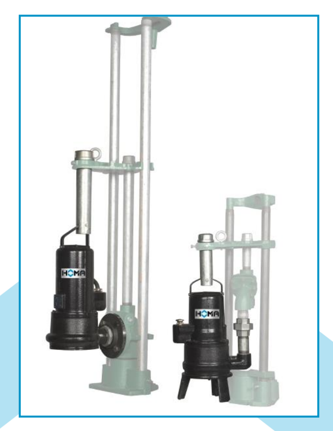
Myers 2 ½" Flanged Adapter and 1 ¼" Threaded Adapter