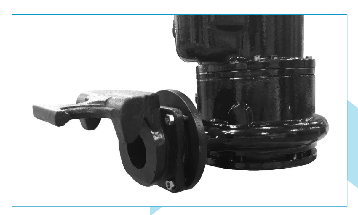
2" EBARA Adapter