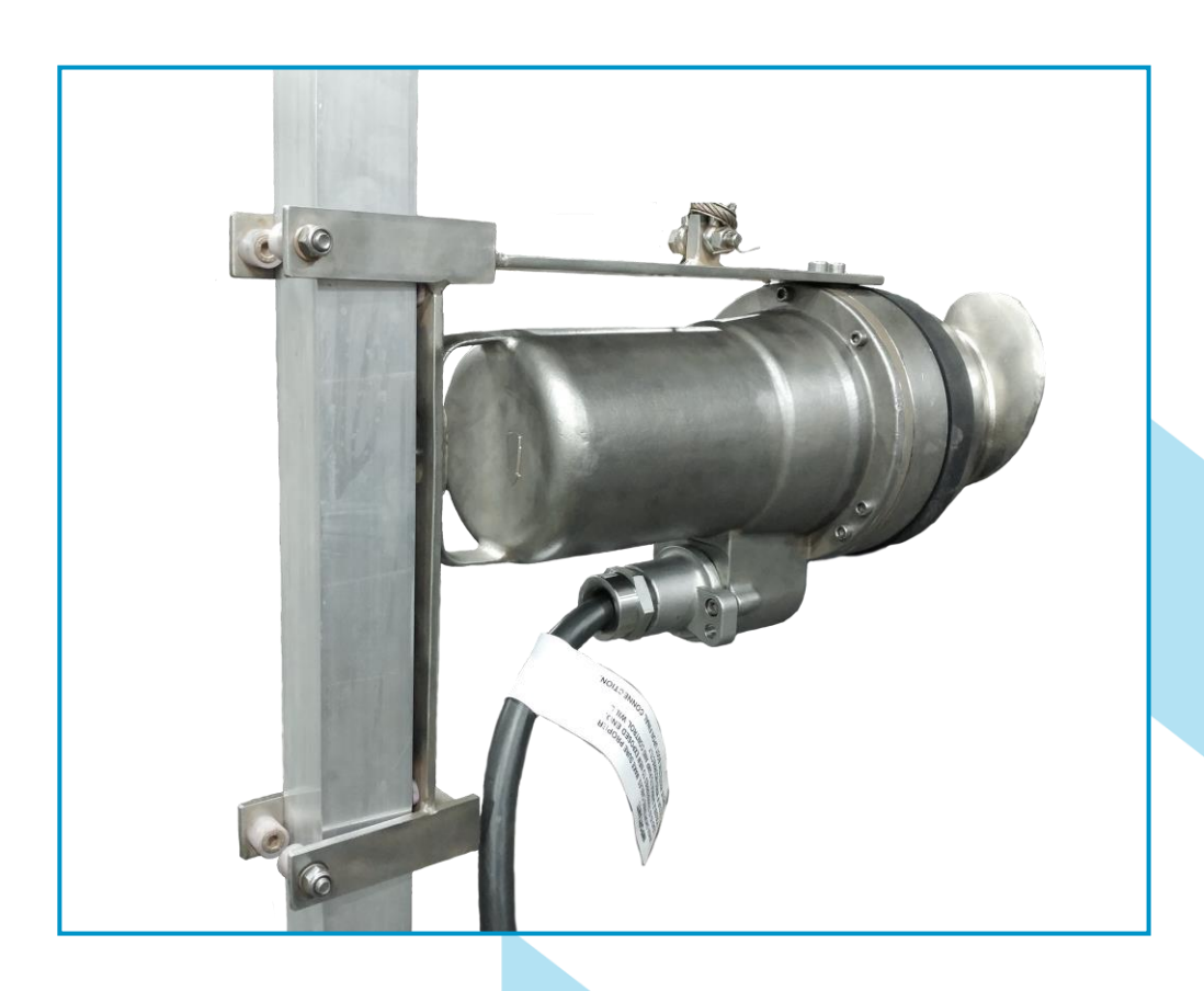
HOMA Mixers fit on standard2 inch square tubing