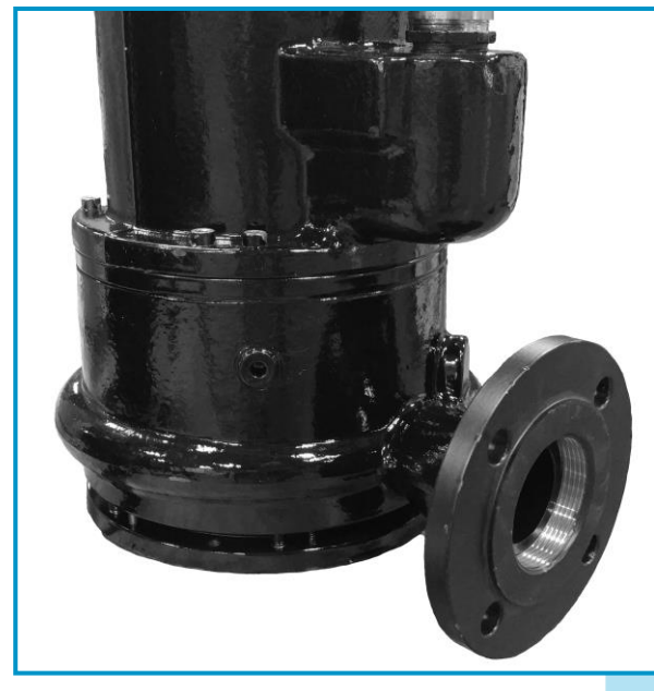
KSB 2" Flanged Adapter