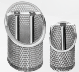
Baskets shown with optional magnetic inserts to trap fine ferrous particles